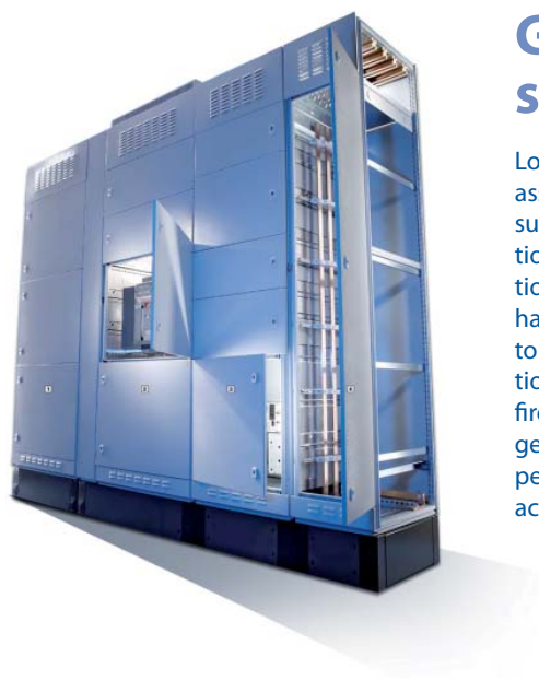
Modular enclosure solutions