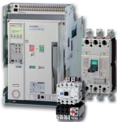
Mitsubishi's fully approved Air Circuit breakers and MCCB's

A key aspect of the system is that it is built around Mitsubishi's type-tested low voltage switchgear products. These air circuit breakers and motor control circuit breakers are approved in accordance with EN 61439-1/2 and ASTA. The Ri4Power enclosures are built around these products and are certified as a design verified assembly in accordance with EN 61439-1/2.