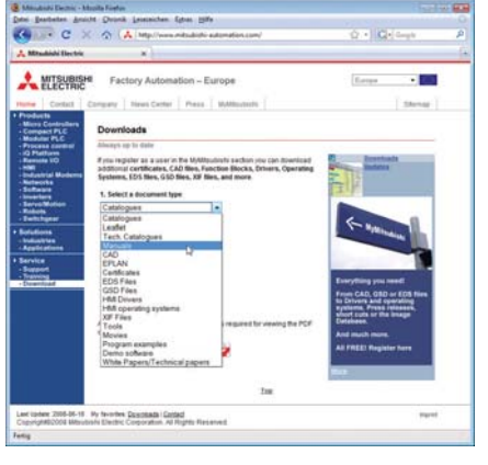
MyMitsubishi offers numerous free downloads.

Click on the "Register Now" link on the MyMitsubishi page to display the registration form. Enter a user name and password of your choice and your contact details, then click on the "Register" button. Shortly after doing this you will receive an email asking you to confirm and complete the registration process. If you ever forget your password just click on the "I forgot my password" link to have it sent to your registered email address. You are in complete control of how we work with you. You can edit, modify or even delete your registration at any time from within your personal profile.