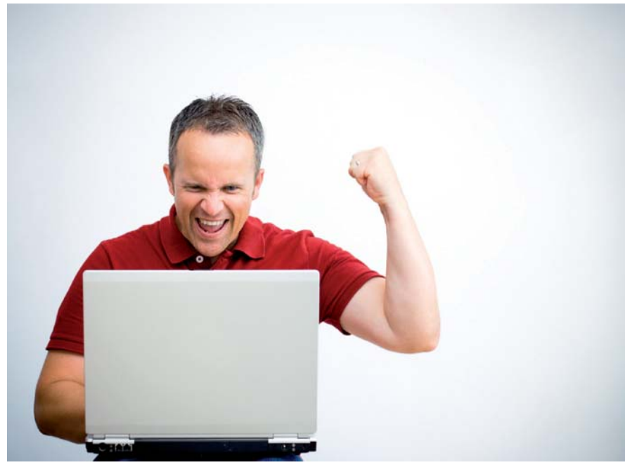
At MyMitsubishi you can find everything you need.