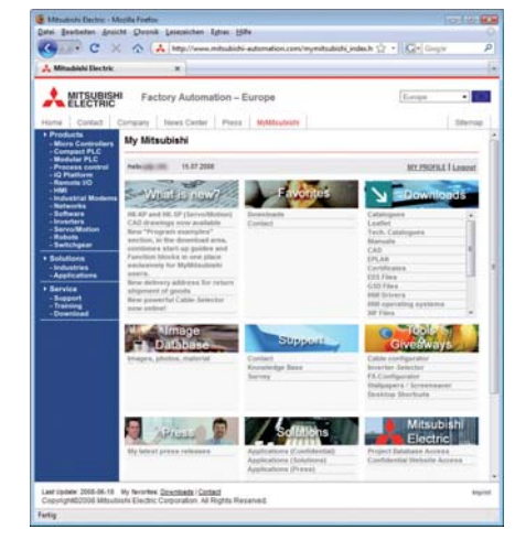
Lots of tools and giveaways in the MyMitsubishi area.

Wondering about our expertise in your application? See how and where we have done it before.