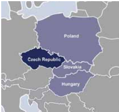
Global partner. Local friend. The countries covered by the CEE FA Center

Many customers across the world are already familiar with Mitsubishi's commitment to product quality, leading edge design and customer care.