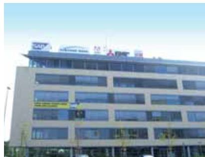
Mitsubishi Electric's new FA center in Prague, Czech Republic.

To date there are 14 centers across the world, three of which are in Europe. The number of these centers is steadily increasing with each being placed in a core manufacturing location.