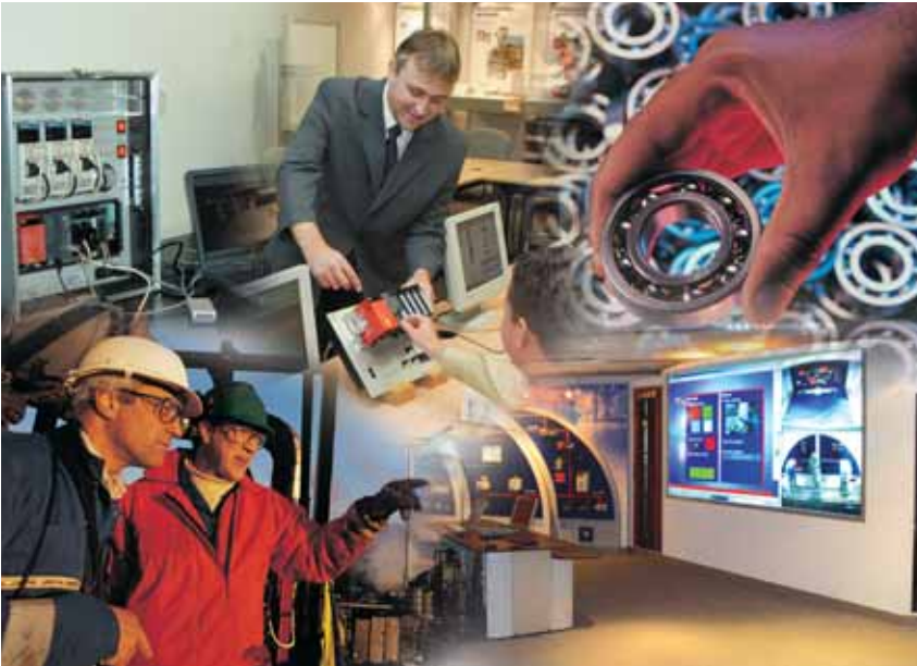
Mitsubishi Electric's "Global Partner – Local Friend" policy provides customers with easy and local access to training and support