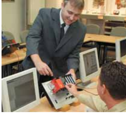
Interactive training facilities

Training is a core service of any FA Center. Locally organised training is regularly available through our distribution and partner networks or at our FA Centers. This type of regular training course is based on standardized training notes and uses comprehensive test equipment/systems to support most customers' requirements.