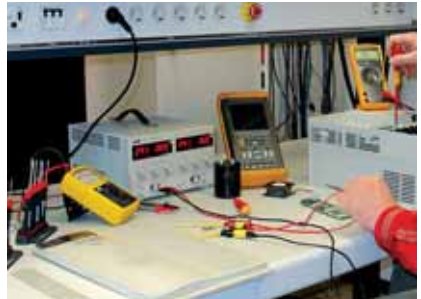
All repairs are carried out by qualified and experienced engineers

Having highly skilled engineers based at each FA Center means we can also offer service and repair functions either locally or managed through our European Service Group. By utilizing the strength of all the FA Centers, distribution partners and service partners across Europe we can ensure that our customers get a responsive service – when they need it most.